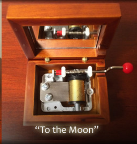
"To the Moon"